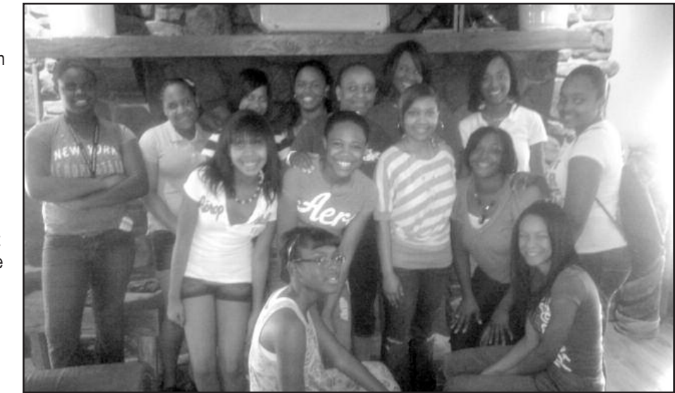
BYOP Retreat Participants

The Resource Center Program hosted an overnight girls retreat at Waverly Waters on May 31st as part of the Abstinence Education focus. A group of 12 teen girls enjoyed speakers and activities that promoted the theme of Be Your Own Person. At the beginning of the retreat, the girls were paired up and given a "Baby Think It Over" infant that became their responsibility throughout the retreat. The girls were the "parents" of the infant, having to meet the needs of the infant during meals, workshops, and throughout the night. In addition to the Baby Think It Over infants, discussions centered around making positive choices, creating a positive image, and exploring peer pressure, self-esteem, and self-control. This retreat was a great opportunity to connect with some special young ladies within the community..