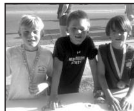
Fun Run Winners